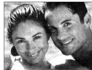
SEE WHAT YOUR SMILE COULD LOOK LIKE