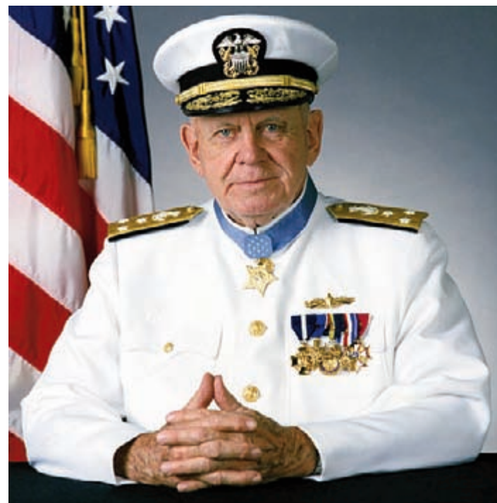
Later in his naval career Bulkeley was promoted to Rear Admiral by President John F. Kennedy.

were civilians. It was 27 days after the fall of Bataan and just a day short of 44 years since Admiral George Dewey had cabled home his victory in the Battle of Manila Bay in the Spanish-American War—the date the United States took possession of the islands. Although the formal resistance was over, knots of brave American and Filipino guerillas who continued to harass communication lines kept in touch with Australia with their weak field radios. General Douglas MacArthur, who was ordered to flee to Australia, pledged his faith as a soldier to