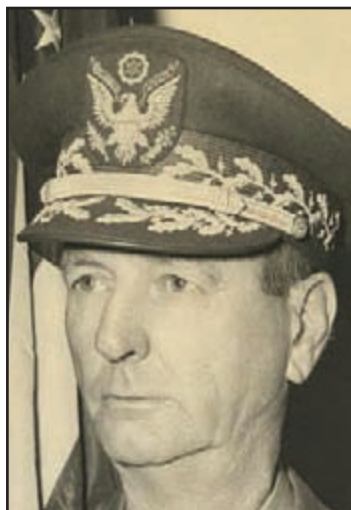
Wainwright after World War II and promotion to full General

General Jonathan Wainwright arranged capitulation terms for the 10,000 weary, hungry, and disease-ridden American and Filipino defenders. About 3,000