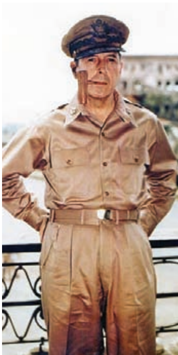
MacArthur at the Manila City Hall, Philippine Islands, 2 August 1945.

were civilians. It was 27 days after the fall of Bataan and just a day short of 44 years since Admiral George Dewey had cabled home his victory in the Battle of Manila Bay in the Spanish-American War—the date the United States took possession of the islands. Although the formal resistance was over, knots of brave American and Filipino guerillas who continued to harass communication lines kept in touch with Australia with their weak field radios. General Douglas MacArthur, who was ordered to flee to Australia, pledged his faith as a soldier to